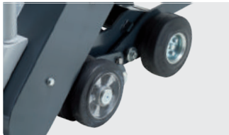
4 x 4 all-wheel