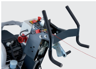
Handle with vibration protection = improved ergonomics