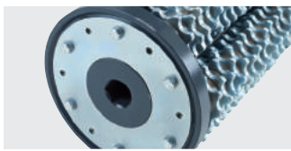
Drum with replacement bushes = longer service life