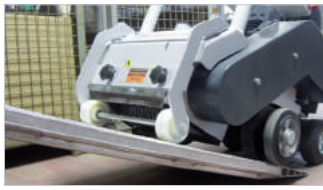
Accessories transportation aid