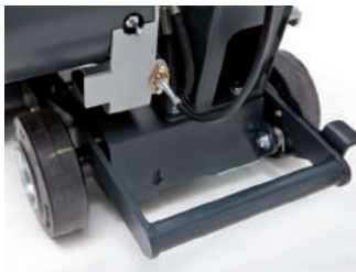
Foot lever for transport position = fast machine relocation